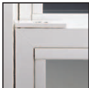
Seamless, welded main frame and sash for superior strength, eliminates air and water infiltration