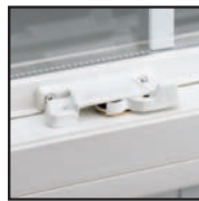
Double cam locks close in opposite directions to create a tighter seal