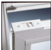
Convenient Tilt Latch Mechanism

Multi-chambered construction provides thermally efficient air pockets