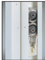
Patented constant-force stainless steel coil balance system and patented locking pivot bar shoe provide for easy sash operation and removal