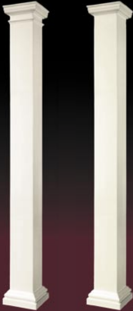
POLY-CLASSIC® DURAGLASS™ TUSCAN NON-TAPERED SQUARE WITH NECK MOLDING