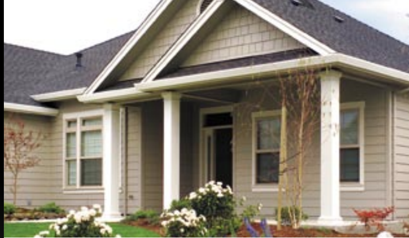
POLY-CLASSIC® DURAGLASS™ TUSCAN NON-TAPERED SQUARE