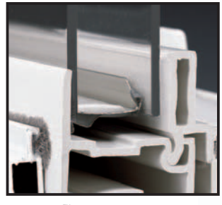
Intercept<sup>™</sup> Spacer System

Our Classic Windows are designed not just for beauty, but are built to last. State-of-theart technology is used to create clean window lines that will improve your home's appearance. Using the highest quality materials and sophisticated manufacturing techniques, we produce well-built, strongly constructed, easy-to-install windows that will provide years of comfort for your family.