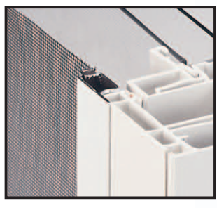
Roll Formed Screen