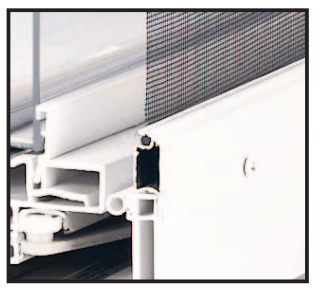
Roll Formed Screen