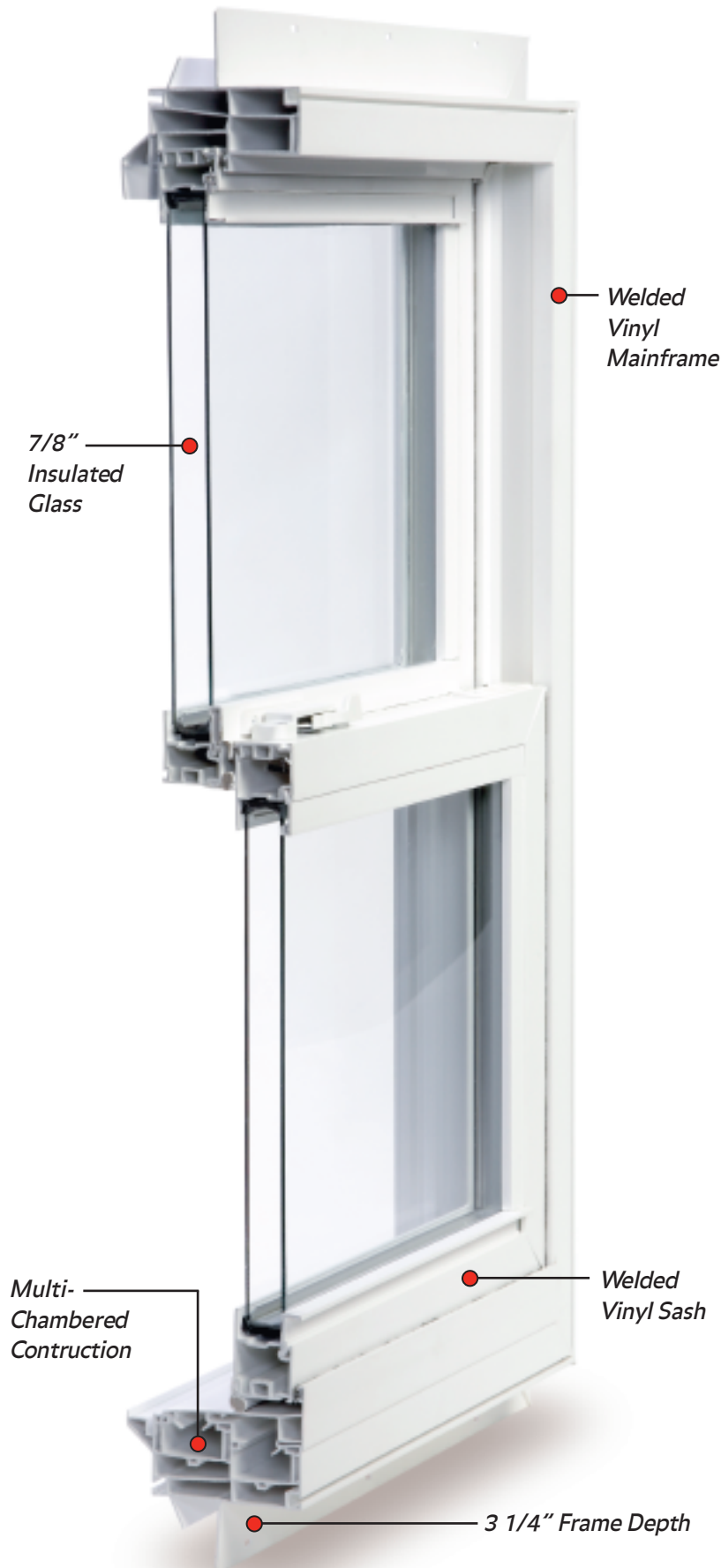
Cross Section of 9555 Sash & Frame