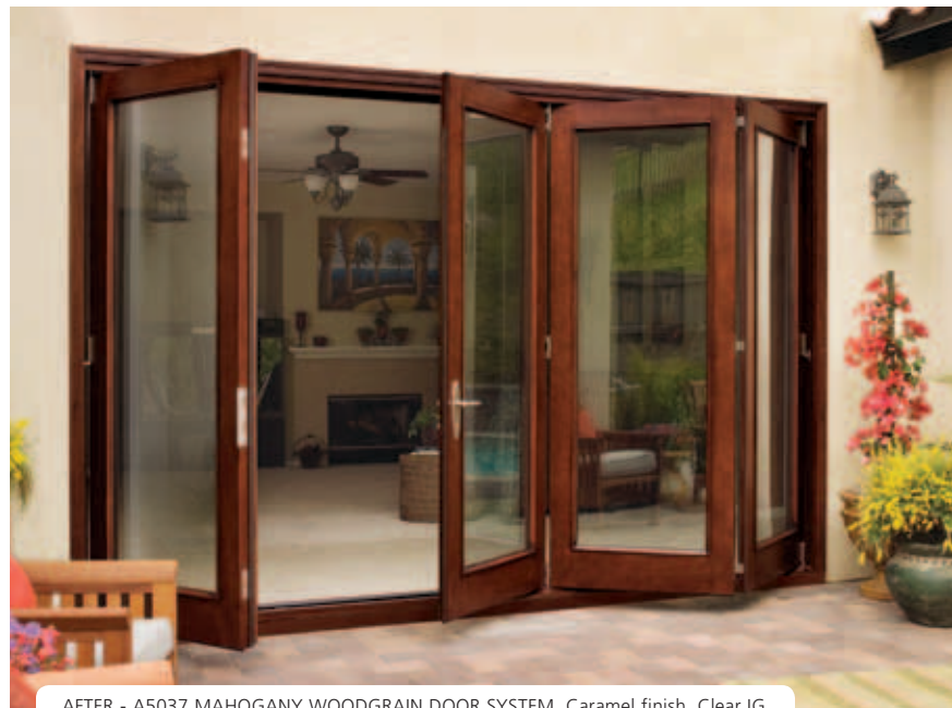
AFTER - A5037 MAHOGANY WOODGRAIN DOOR SYSTEM, Caramel finish, Clear IG

*To review complete warranties, visit www.jeld-wen.com .