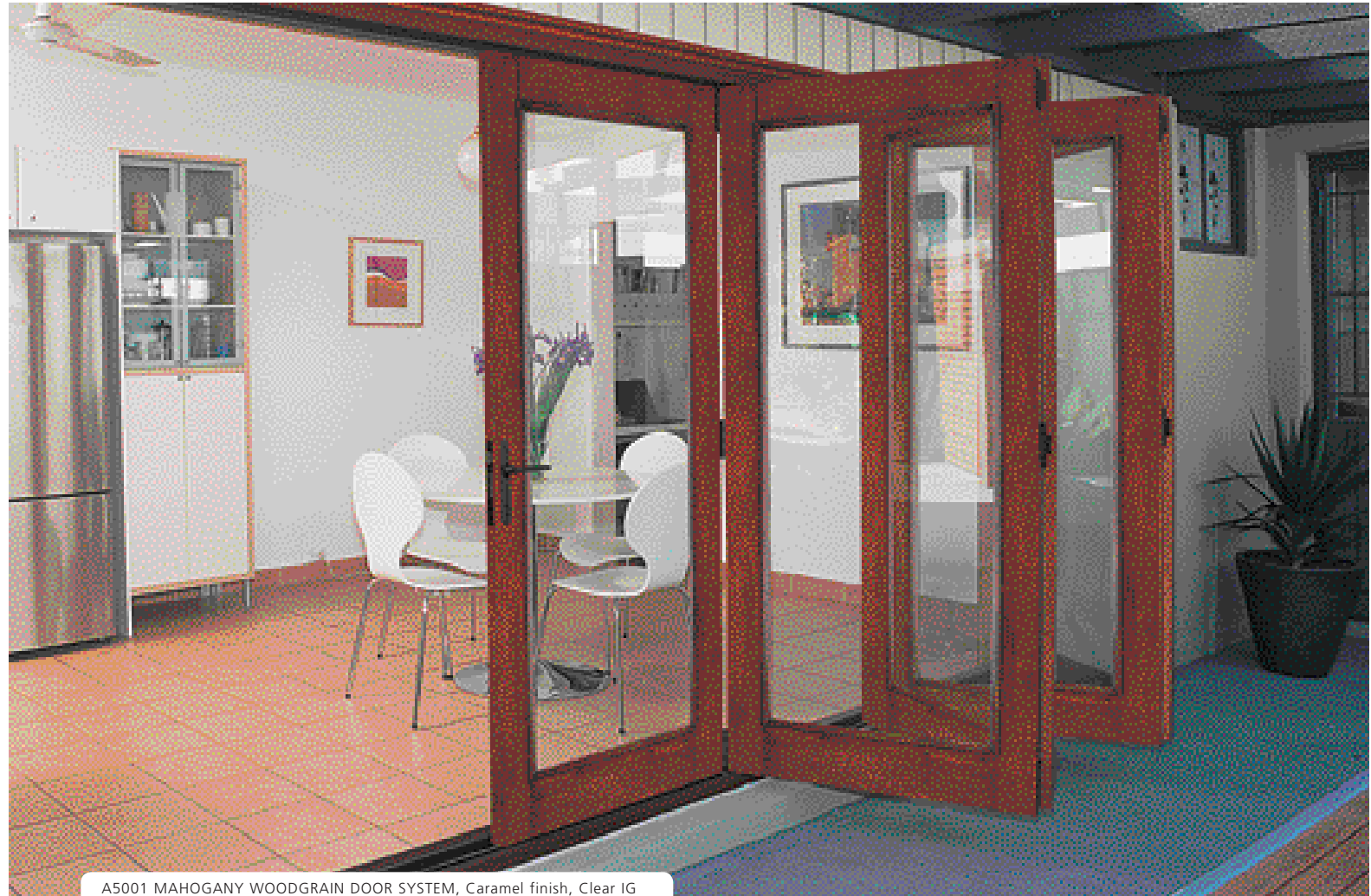
A5001 MAHOGANY WOODGRAIN DOOR SYSTEM, Caramel finish, Clear IG