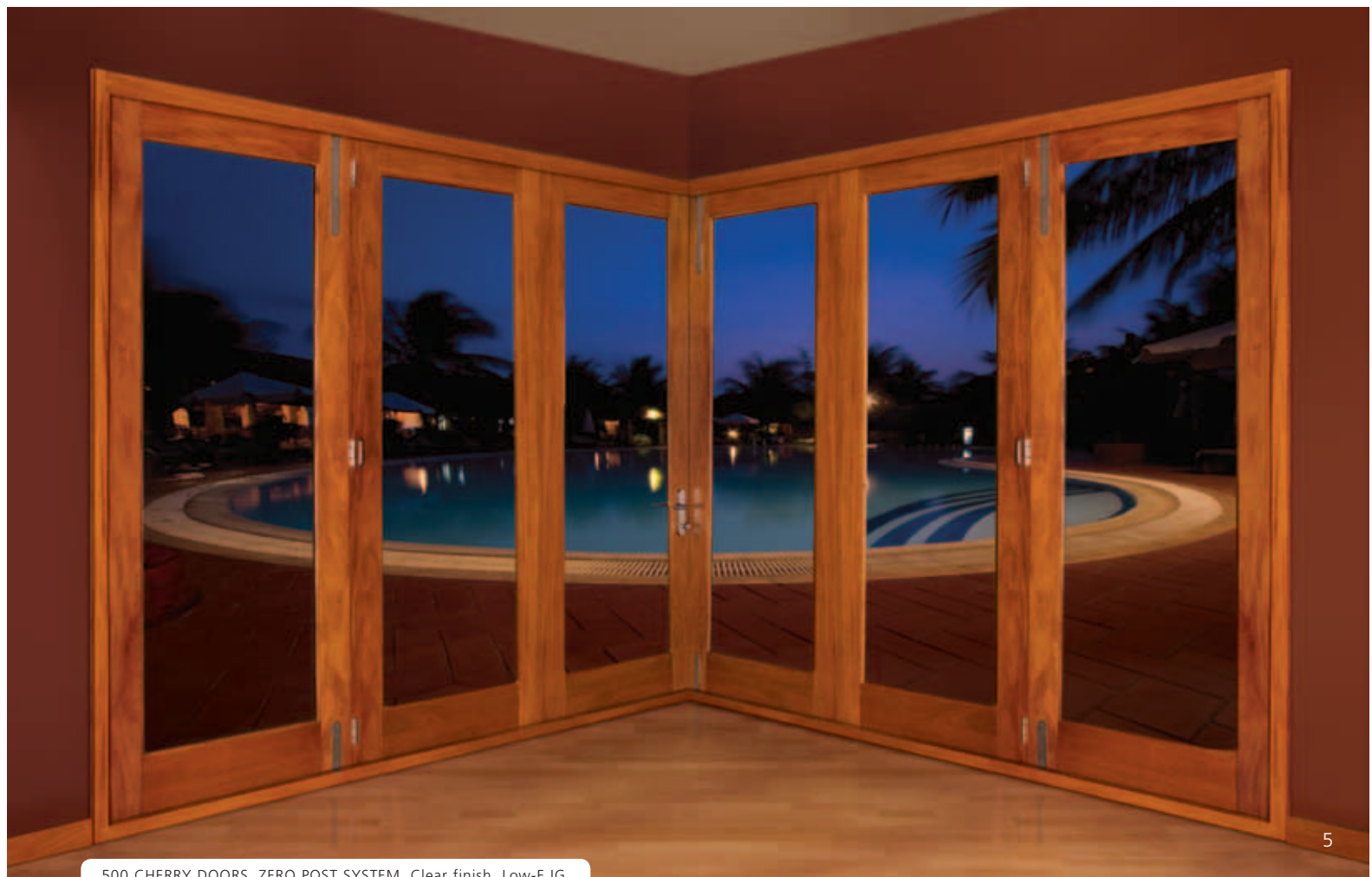
500 CHERRY DOORS, ZERO POST SYSTEM, Clear finish, Low-E IG