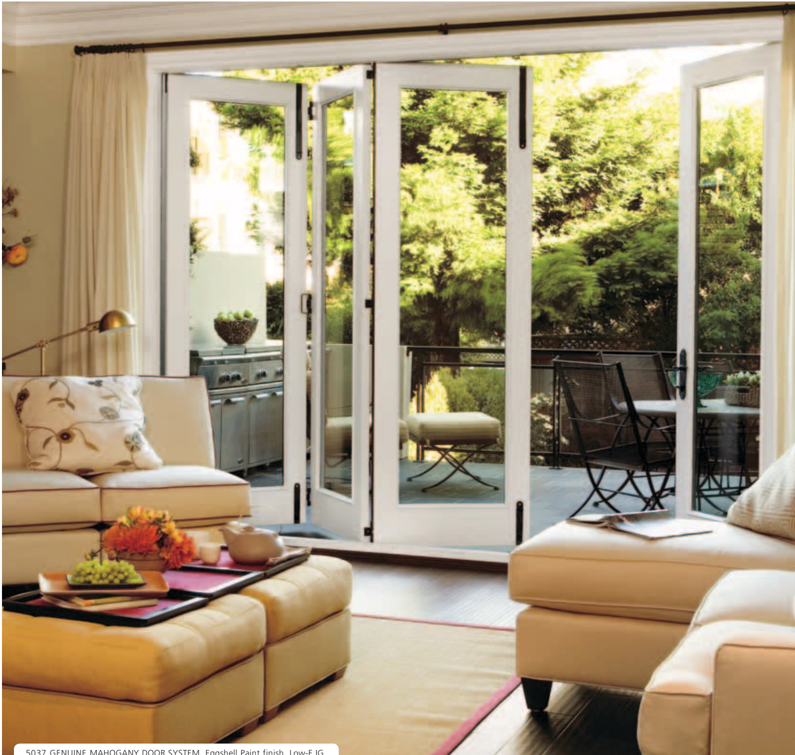
5037 GENUINE MAHOGANY DOOR SYSTEM, Eggshell Paint finish, Low-E IG